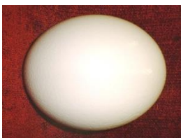
An ostrich egg