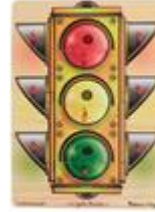
Gilbert's first traffic light