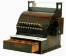
A cash register