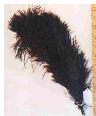
An ostrich feather