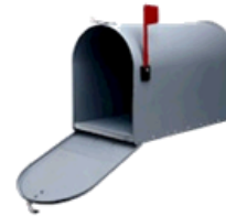
Something that came from Gilbert's Airport